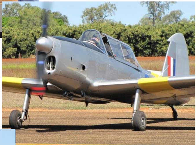
Right: de Havilland Chipmunk owned by NQ Warbirds fires up for another local sortie.