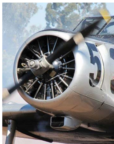
Above: A rumbling radial and plenty of smoke on start-up—the Winjeel fires up.