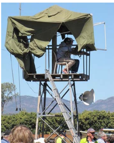
Above: Accommodation for the commentators was fairly basic!