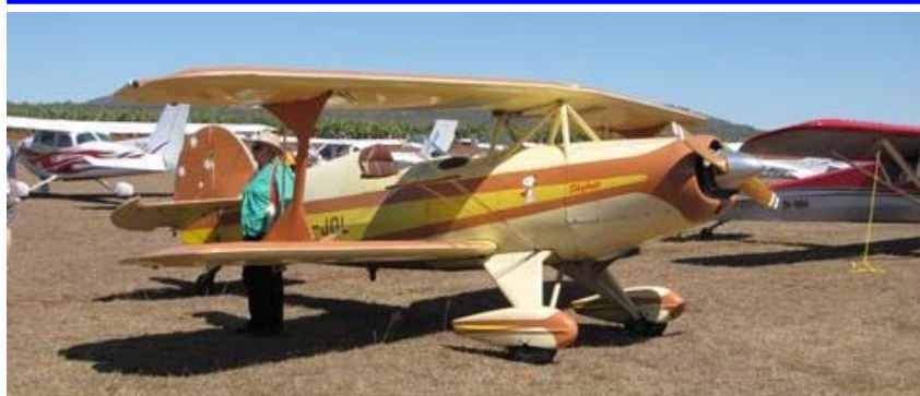
Above: This amateur-built Skybolt was seen in the GA line-up at the recent NQ Warbirds Mareeba Airshow.