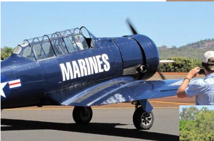
Left: T-6 Harvard owned by NQ Warbirds taxis along the crowd-line.