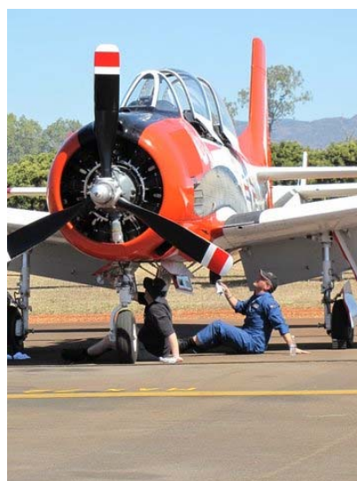
Above: Trojan wipe-down.