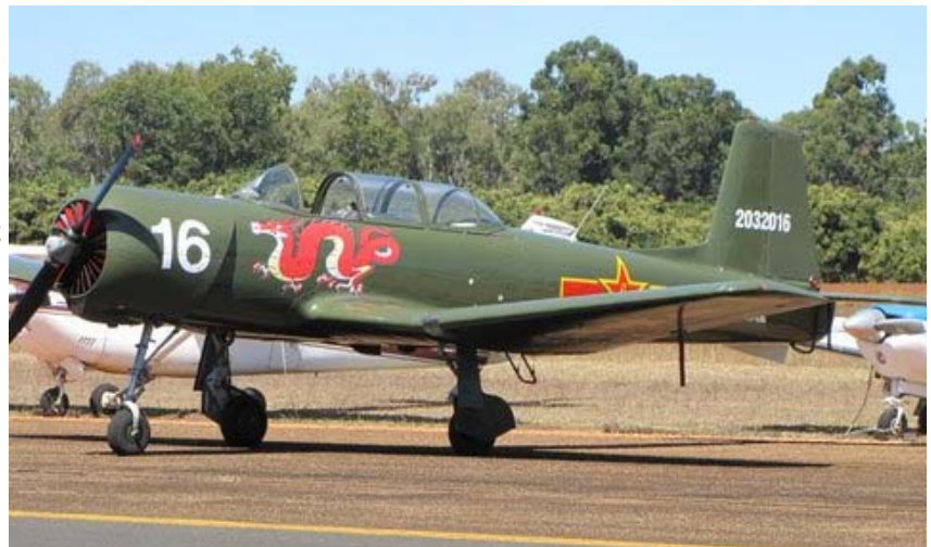
Right: NQ Warbirds Nanchang at rest.