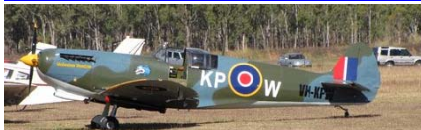
Above: Not a genuine Warbird but this brand-new 100% Spitfire replica, built by Paul Beattie and owned by Pat English of Cairns, is cause for a double-take. There's no Merlin up front but Pat says it is strong enough to take one, if your wallet is deep enough to feed it! (Photo—C D Smith).