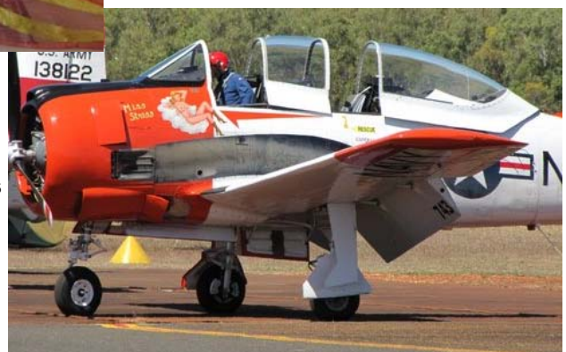
Right: Toowoomba-based T-28 Trojan “Miss Stress” visited Mareeba for the event.