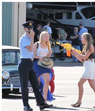
Above: "Ahh, Security ... we have a situation here—armed intruder on the airfield!"