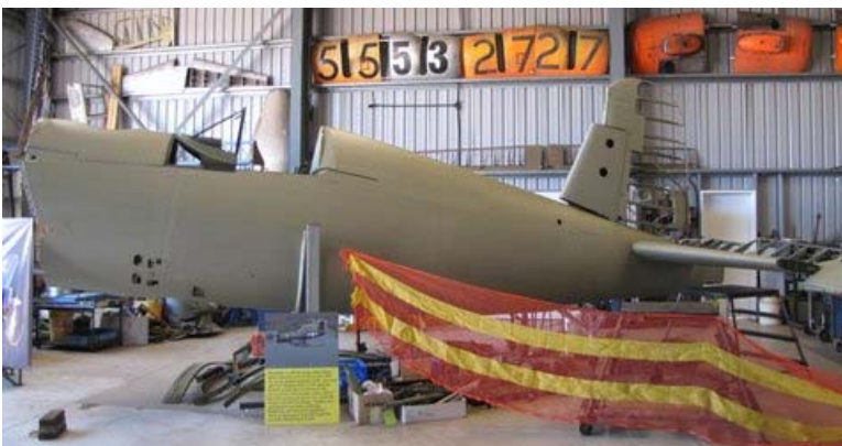
Left: NQ Warbirds Corsair project showing progress on the fuselage so far.