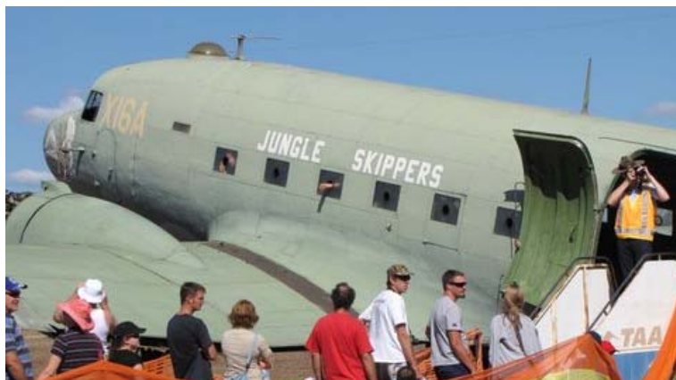
Above: The Dakota is always a people-magnet at Mareeba Airshow and the engine-run is a feature of the event.

Newsletter of Queensland Vintage Aeroplane Group / Australian Flying Museum Inc.